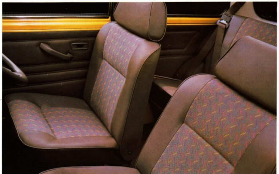
Above: Mini Mayfair. Right: Mini City interior. Main picture page 33: Mini City

Stealing that last parking slot. And grabbing all the looks. Minis have more fun!