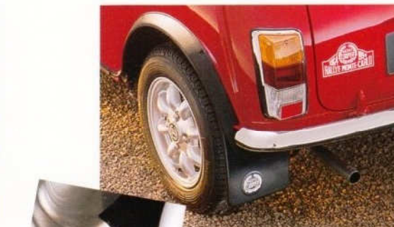
Rear mud flaps bear the Mini Cooper logo.