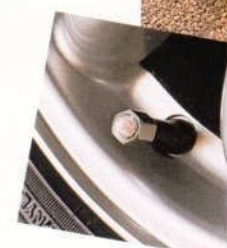
Distinctive, hexagonal tyre valve caps carry a red and green Mini Cooper Logo.