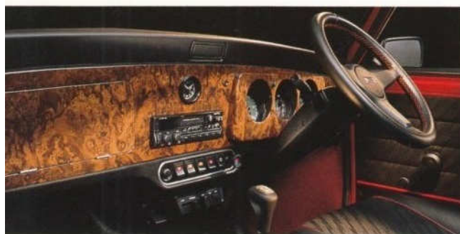
The walnut fascia and R750 electronic stereo radio cassette (factory-fit options) add the finishing touches of traditional ambience and driving pleasure.

The names of Mini Cooper and Monte Carlo belong together. Now you can re-create the memories, and re-live the victories in one of the most distinctive British cars on the road today.