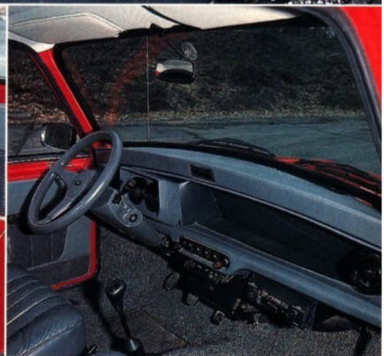
A sea of grey inside the Cord but large leather content too. Good, quiet interior. Below left: lots of local parts used, as well as GRP mono-coque